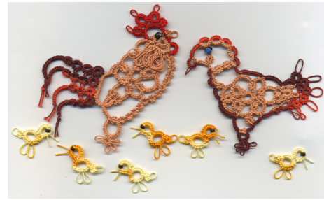
Click here for larger picture

This is the link back to Norman . The kids have no names allocated!.