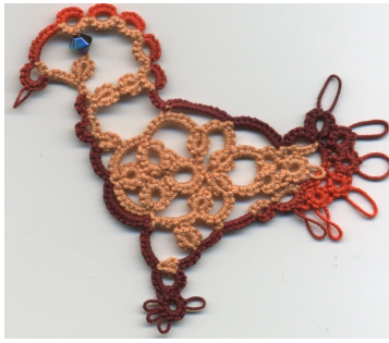
Click here for larger picture