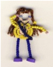
Pamela Myers - Irish brownie