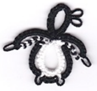
Click on here for larger picture