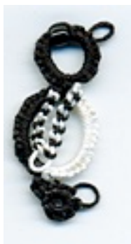
Click on here for larger picture